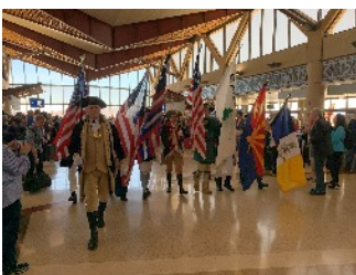
AZ CG leads them out.