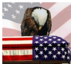
Freedom is not free.

Two WWI and 26 Korean Veterans returned to Sky harbor. We can never thank them enough for their Sacrifices. Our ancestors fought for our liberty and these veterans have fought to keep us free. God Bless all our Veterans and God Bless America.